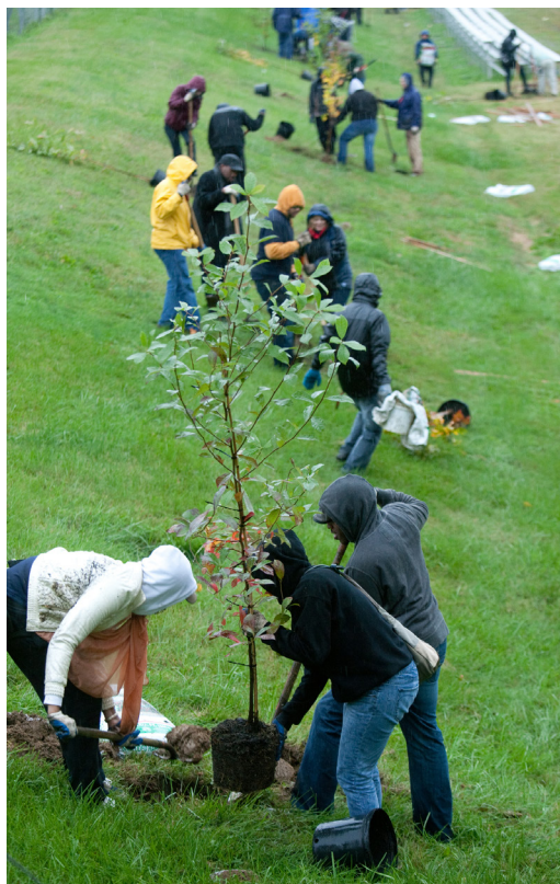
The Community Greening program includes tree plantings that draw volunteers of all ages. In 2012, Blue Water Baltimore planted 1,995 trees at 39 different events.

A community organizer, who joined the staff in 2012, helped to extend the outreach ef-