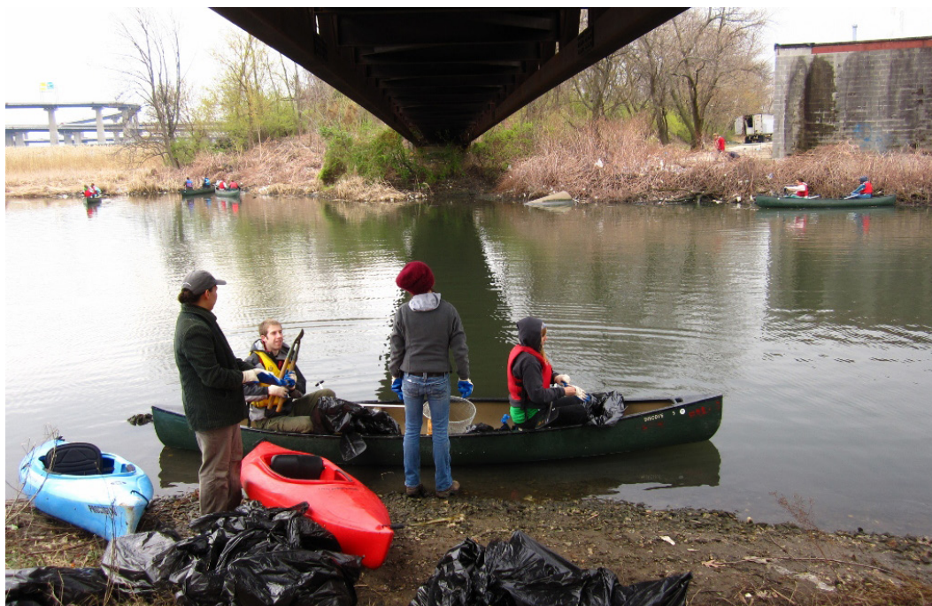
Blue Water Baltimore is working to prevent and remove trash in waterways. In 2012, they worked with volunteers to remove 61,460 pounds of trash during 78 stream clean-up events.

forts that were taking place through restoration and education projects. The organizer meets with neighborhood residents, talks about assets and problems, identifies potential projects, and helps make them happen. She also teases out the issues that communities have in common so that Blue Water Baltimore can draw attention to them.