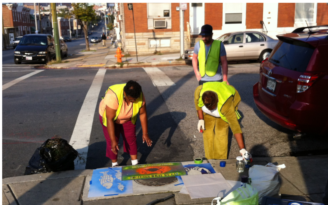
Blue Water Baltimore's Clean Water Communities program helps with stewardship outreach, like storm drain stenciling shown here, as well as on-the-ground projects to protect and restore local waters.

Robin Leone, Blue Water Baltimore Board of Directors