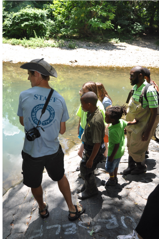
Neighborhood youth join in a Blue Water Baltimore stream walk to learn about fish and other aquatic creatures in Herring Run.

4) The merger itself is an opportunity for fundraising and membership drives. Both the staff and board of Blue Water Baltimore believe they missed membership and fundraising opportunities during the introduction of the new organization. With many legal and